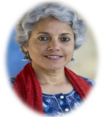
Dr. Soumya Swaminathan Chief Scientist, WHO, Geneva